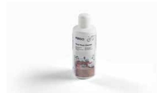
Pergo Vinyl Floor cleaner 1L PGVCLEANING1000