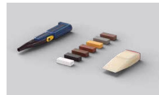
Pergo Repair kit PGREPAIR